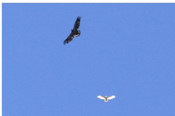
Albino Red-tail Hawk with an immature Golden Eagle