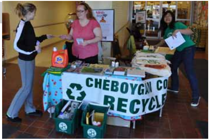
Recycling at Glens.

Please visit www.earthweekcheboygan.com for the full sponsor list and many photos. Coming together, we did it!