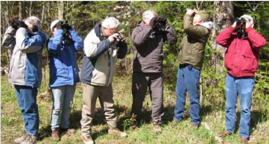
No bird escapes us.