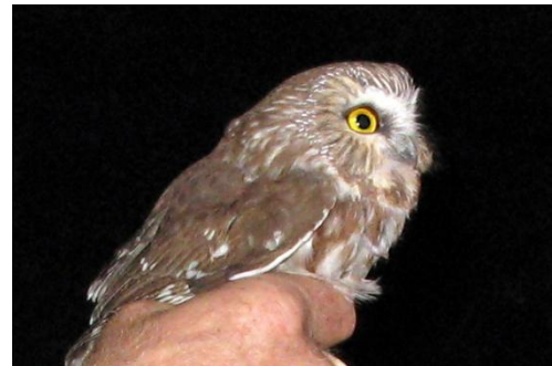
NSWO - J Kirby

I had a good fall netting Northern Saw-whet Owls [NSWO] at Pt. LaBarbe near St. Ignace. During early October the weather was too nice with all the south winds over a week which stalled migration. Members of SAAS came to observe the netting operation on Oct. 1 st and saw several owls banded; a total of 16 owls were banded that night. Most were banded after the observers left for the evening. Some members of the Petoskey Audubon Society also attended and were able to see some owls banded.