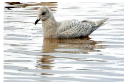
Iceland Gull - S. Baker

Approximately 19 rough-legged hawks were counted throughout the day, with one dark morph spotted. Good looks were had at white-winged crossbills, snow buntings, and 5 sharp-tailed grouse. Later in the day, 10 more sharp-tailed grouse were found in a field. Moving on to the Dafter landfill, a red-tailed hawk, bald eagles, ravens and a beautiful adult glaucous gull as well as a juvenile were seen. An Iceland gull swimming in a pond