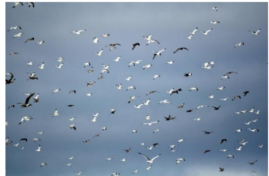
da Dafter Dump Gulls

Holy Wah! we're back to da Yoop. We will be searching for UP early winter specialties such as Gray Jay and Boreal Chickadee at da Hulbert Bog; Rough-legged Hawks, Sharp-tailed Grouse, and Snowy Owls in da Dryberg area; and Glaucous, Iceland, and Great Black-backed Gulls at da Dafter Dump.