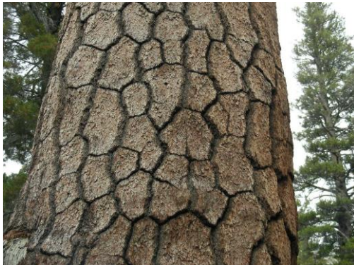
Ponderosa Pine

Picture puzzle bark of the ponderosa pine prompts people to pause