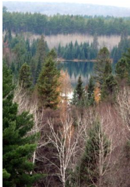
Inspiration Point - J. Kirby

We will be walking around the Inspiration Point area again. This beautiful site was the the location of a CCC camp and many ornamental fruit bearing trees( Siberian Crab mostly) attract a wide assortment of birds in the late fall. We will almost certainly see many Robins and hopefully more northern visitors such as Bohemian Waxwings and Pine Grosbeaks. Elk are always a possibility anywhere in the PRC. We will meet at Schultz's Marathon Gas just to the east of the Wolverine I-75 exit, at 8:30 am.