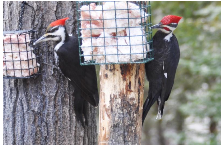
The view from the Kirby's kitchen window, a male and female Pileated woodpeckers.